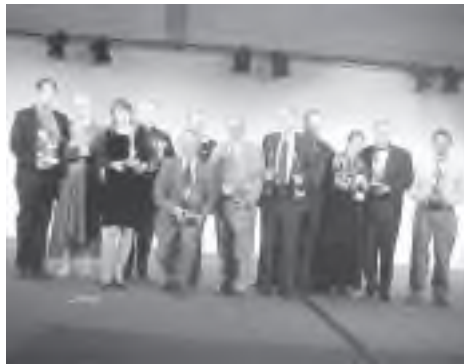
Acceptors for 1951 Retro-Hugo Awards